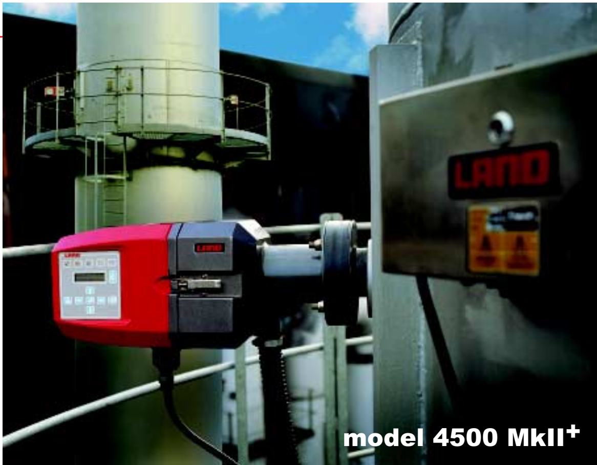
model 4500 MkII +