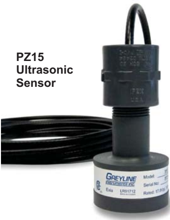
PZ15 Ultrasonic Sensor