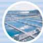
Water supply system