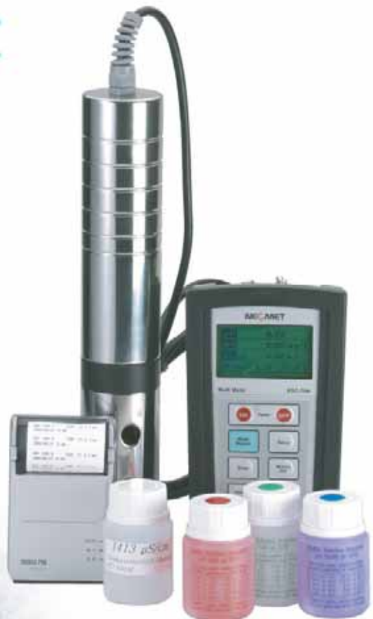
- PDC-70N Set -

pH Electrode Storage Solution pH Buffer Solutions (pH4.00,7.00,10.00) pH Electrode Filling Solution Conductivity Standard Solution DO Membrane Kit Printer Paper