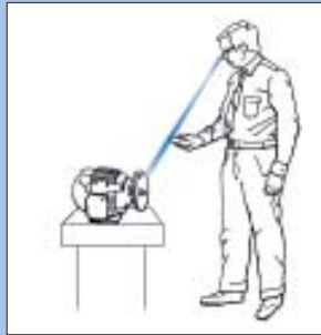
Non-Contact Measurements- View Target & Display Simultaneously