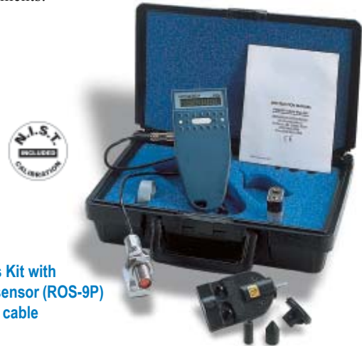
Pocket-Tach Plus Kit with optional remote sensor (ROS-9P) with 5 foot (1.5m) cable

Pocket-Tach 100 is a general purpose non-contact optical tachometer that measures from 5 to 100,000 RPM with an accuracy of up to \pm 1 RPM. It is supplied in a padded carrying case and may be equipped with the optional Contact Tip Assembly ( CTA-1 ) to make contact RPM measurements.