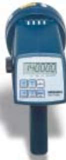
Nova-Strobe Phaser Strobe Series