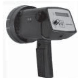
Nova-Strobe Vibration Strobe Series