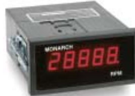
ACT Panel Tachometer Series