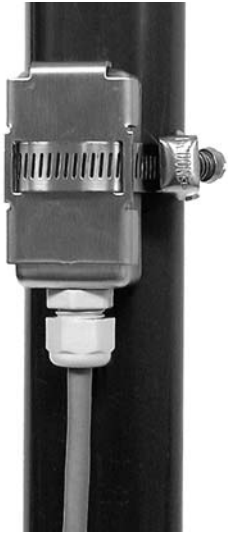
DFS-II Doppler Sensor with Pipe Clamp